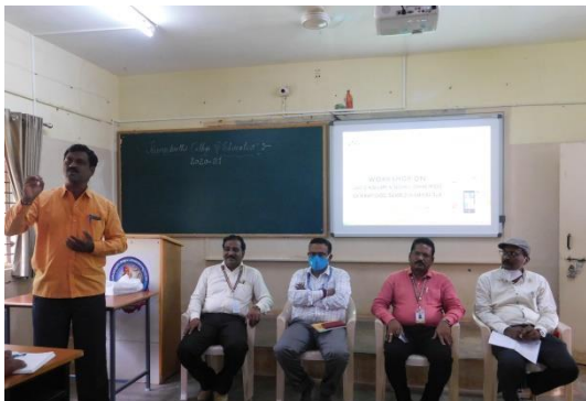
Participant of the workshop sharing the opinion