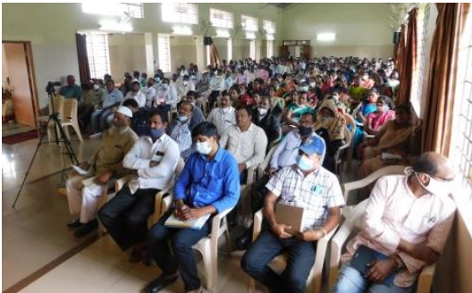
Participants of the Workshop Inauguration programme