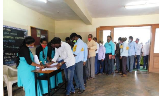
Participants Registering for the Workshop